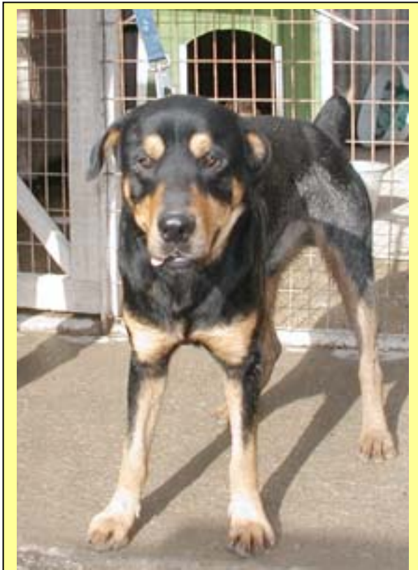
'Harley' getting ready with one thought in mind !