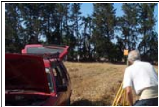
Our surveyor at work

The builder has scraped the land ready for our surveyor to mark the levels and building lines. The perimeter wall and fence is being erected. The plan is to get all the ground work and drainage done by the end of August which should give us time to complete the Shelter before the end of October.